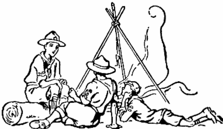
Members of the Scouting family: Cub, Scout and Rover Scout.